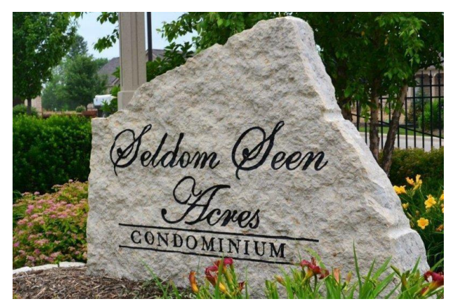
NEWSLETTER February 2024